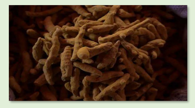
Fig no 3. Turmeric