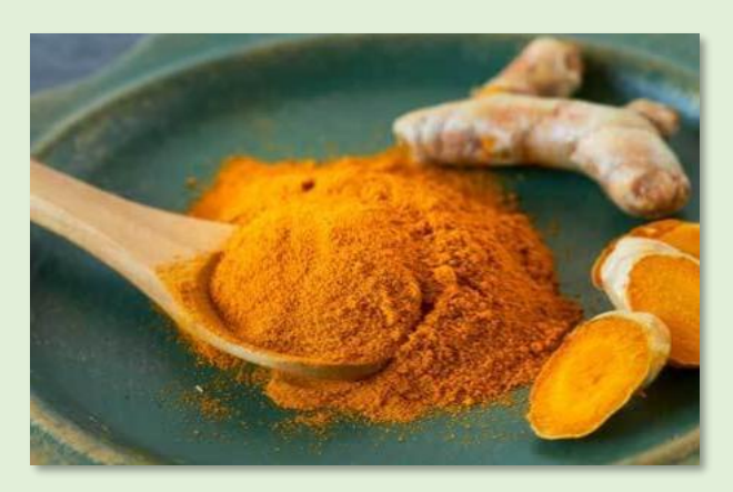
Fig no 1:-curcumin powder

Cultivation: Turmeric is commonly cultivated as a crop, with rhizomes harvested for various purposes [4]